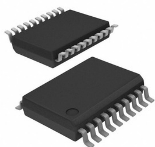
Bild kann Representatioun sinn. Kuckt Spezifikatioune fir Produktdetailer.