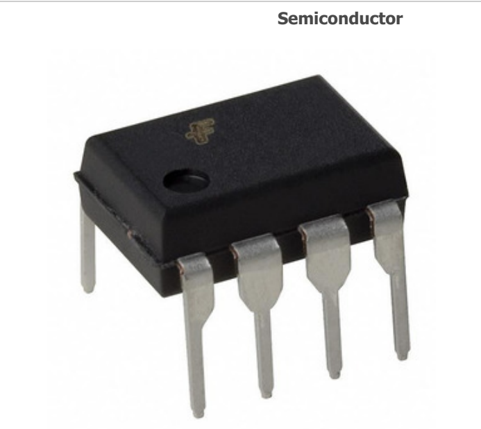
Bild kann Representatioun sinn. Kuckt Spezifikatioune fir Produktdetailer.