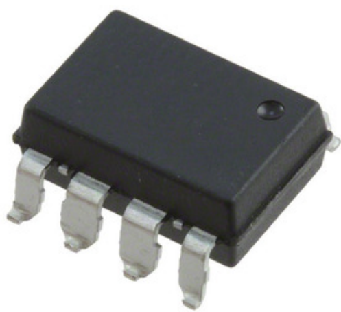
Bild kann Representatioun sinn. Kuckt Spezifikatioune fir Produktdetailler.