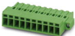
The figure shows an 10-position version

PCB connector, nominal current: 12 A, rated voltage (III/2): 320 V, number of positions: 6, pitch: 5.08 mm, connection method: Crimp connection, color: green