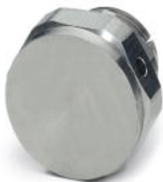
Pressure compensation element, Nickel-plated brass, Application: Ex, Connecting thread: M25, Color: silver

Please be informed that the data shown in this PDF Document is generated from our Online Catalog. Please find the complete data in the user's documentation. Our General Terms of Use for Downloads are valid ( http://phoenixcontact.com/download )