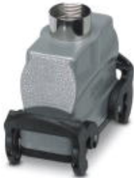
HEAVYCON B24 coupling housing, with double locking latch, height: 81.5 mm, with 1 x Pg29 gland, straight cable outlet

Please be informed that the data shown in this PDF Document is generated from our Online Catalog. Please find the complete data in the user's documentation. Our General Terms of Use for Downloads are valid ( http://download.phoenixcontact.com )